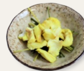
Fish / ត្រី 0.5$