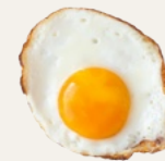
Fried Egg / ពងចៀន 0.5$