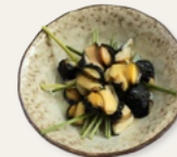
Snail / ខ្យង 0.5$