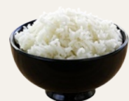
Rice / បាយស 0.25 $